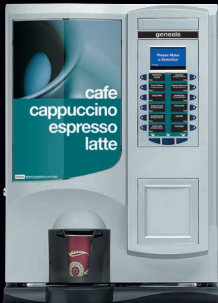
Genesis - Silver/Abstract Graphic

■ Selections made from fresh ground beans at high pressure