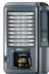
Cup station accepts up to 14 cm high jugs.