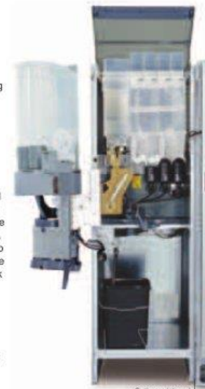
Optimum internal access - when the top panel is lifted the door cannot be closed.