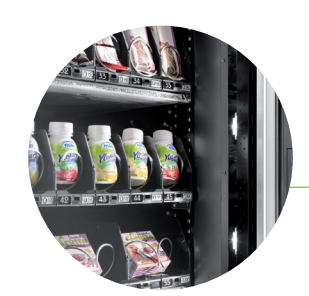
Stratified temperature inside the cell