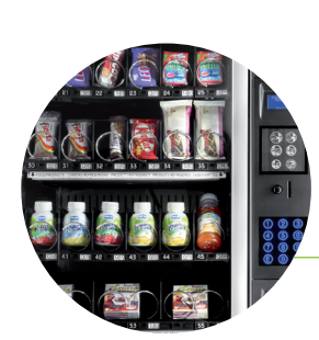
Maximum flexibility with a reduced footprint